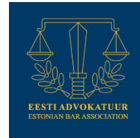
Estonia / Estonian Bar Association