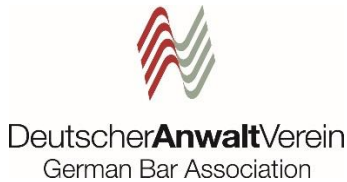
Germany / German Bar Association