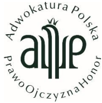
Poland / Polish Bar Council